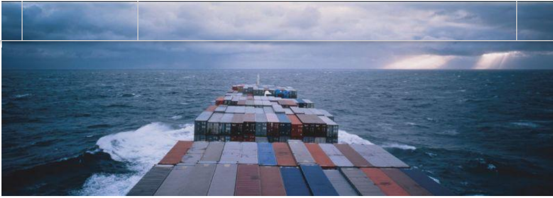
Allan Sekula, Still from The Forgotten Space (2010), Co-directed with Noël Burch.