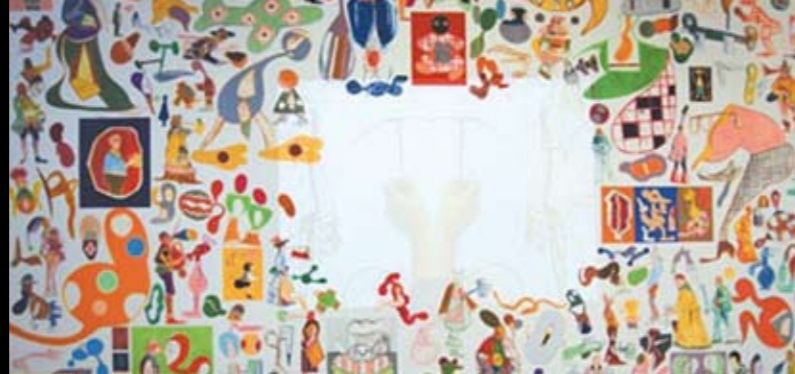
Image: Mark Braunias Visual Bank

An installation in which the artist has created a world of brightly coloured comic figuration across the walls of the Gallery's Atrium. Paintings on canvas, board, paper, acetate and plywood cutouts converge towards the central wall where directly hand painted imagery integrates with film footage of the artist at work, the audience and animation.