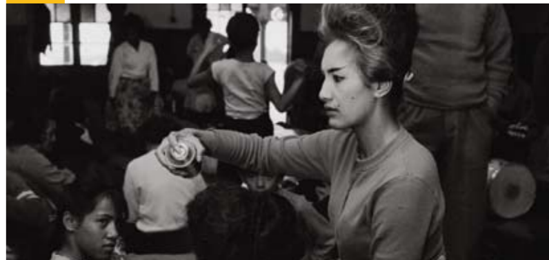
January 25 celebrations, before the church service, Ratana Pa, 1963.

In association with Blair Wakefield Exhibitions (BWV).