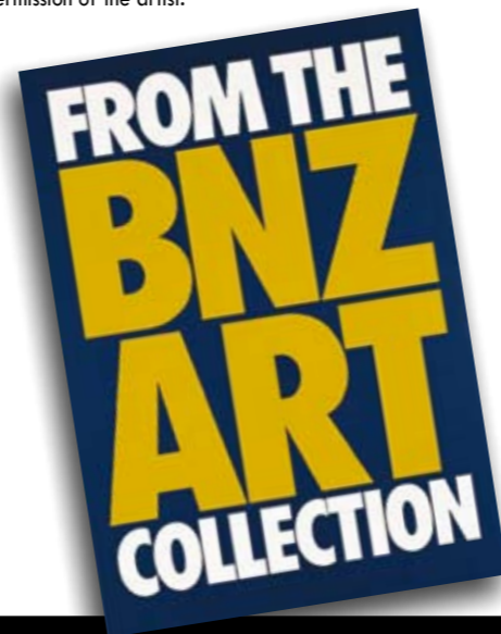
Image: Billy Apple From the BNZ Art Collection , 1988. Acrylic on canvas. Reproduced by permission of the artist.

Boom Time Art from the Bank of New Zealand Collection