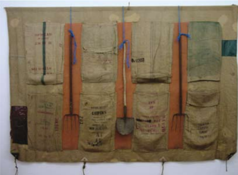
Image: Don Driver Beans Lupins and Wheat , 1982.

RECENT work by ten New Zealand photographers